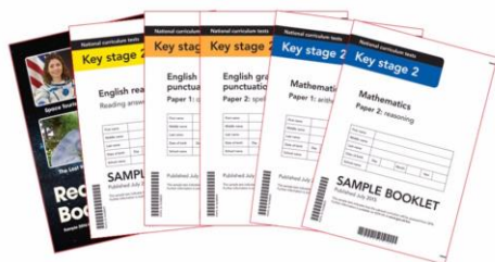
Key Stage 2 tests - 2017

We will be holding a meeting for all Parent & Carers with a child in Year 5 and 6 to explain the Key Stage 2 SATs and Teacher Assessments. This is where we will be able to explain how we have been preparing your child for the tests and how we plan to do so in the coming weeks. It also explains how you can support your child at home. We will be reminding you about the meeting at Parent Teacher Consultations.